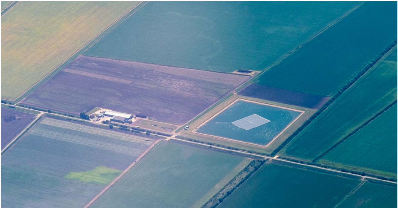
Solar panels floating on an irrigation pond.